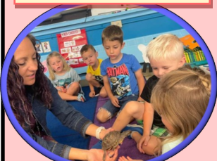
Playing with class pet turtle