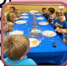
Prince & Princess Day for Letter P Week